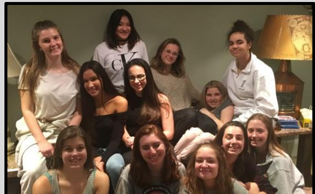
A group of staff from 2016