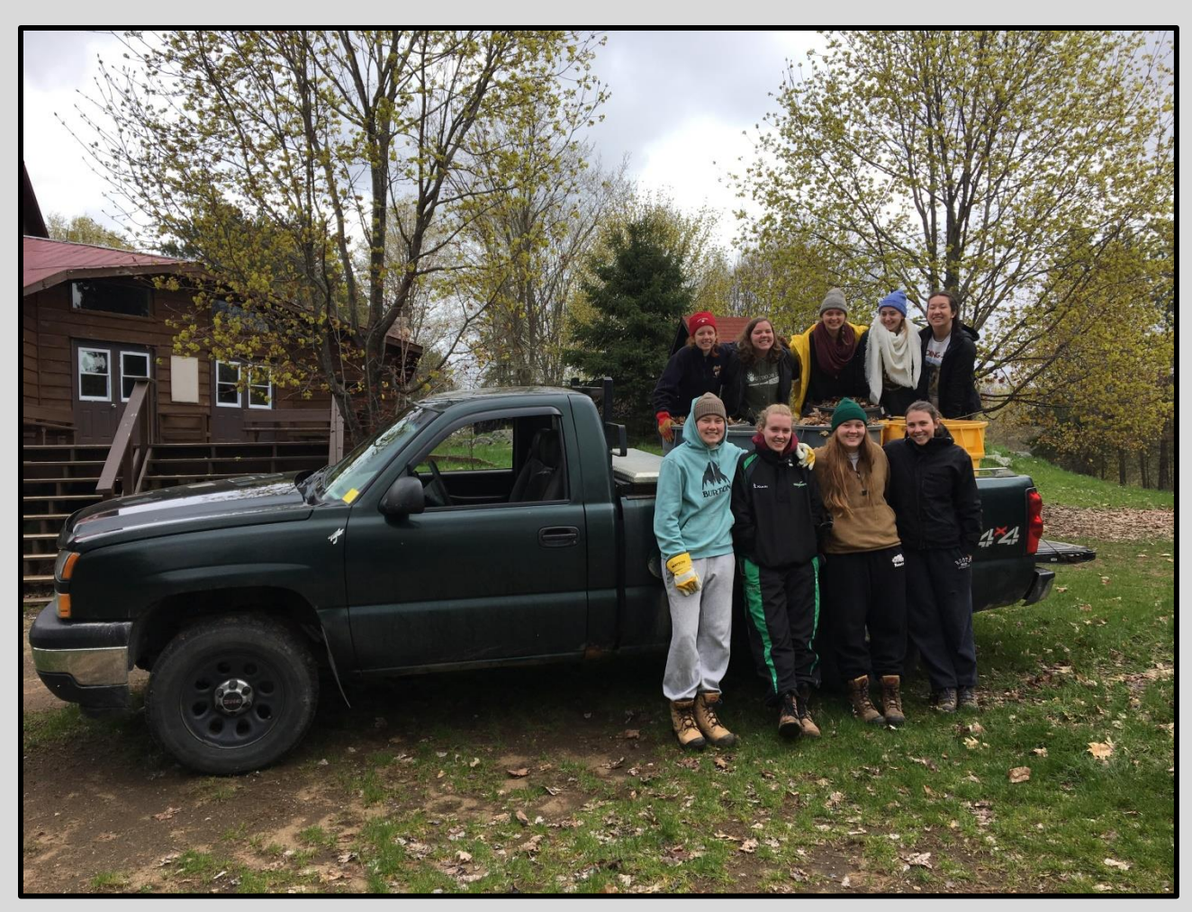
First Day of Work Camp!