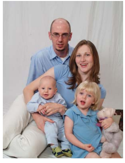
The Poore Family