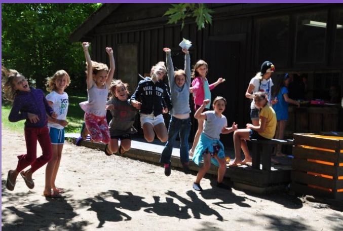
The Tuck Shop is still the most popular place in camp!

It was a beautiful close to the summer, but we both agreed we prefer camp when it is alive with the energy of a couple hundred happy campers. Luckily, as winter rushes in we are coming closer and closer to our 87 th summer in 2011!