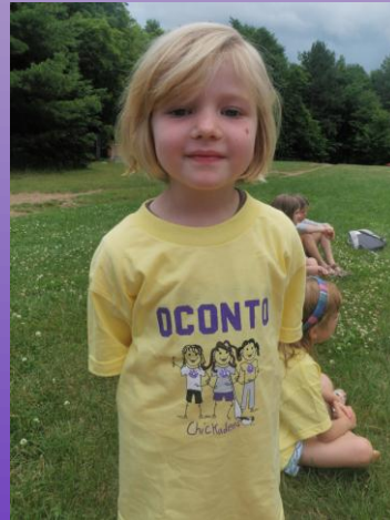
One of our June Pre Tads, known as Chickadees, showing off her new shirt!