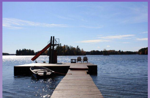
Main Dock on a sunny Fall afternoon