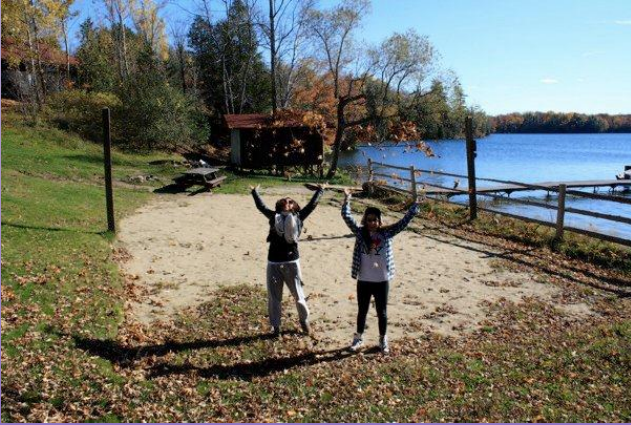
Two staff visiting camp to check out what is in store for next year's work camp staff!