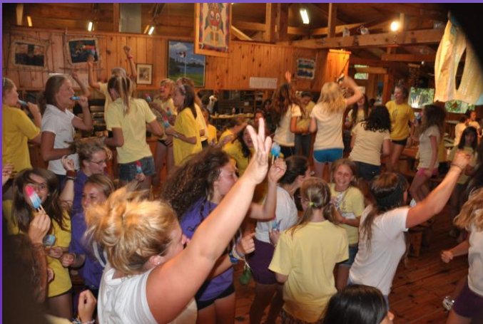
Dining Hall dance parties were a summer 2010 favourite!