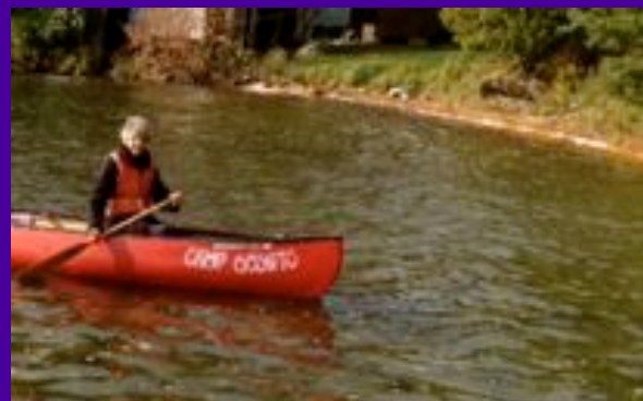
Mom enjoying a paddle on Eagle Lake during Thanksgiving Weekend