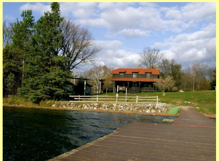
Most of the docks have been stored for the winter.