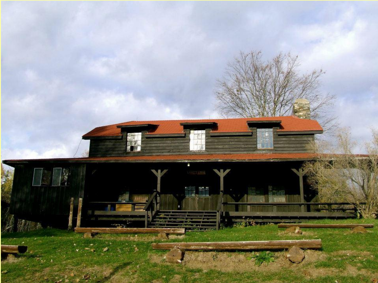
Labbett Lodge, October 2011