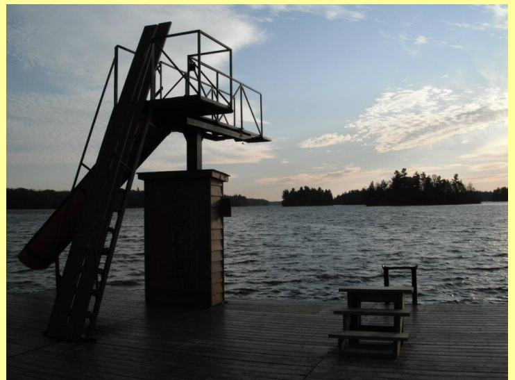
The diving board will not be out again until next spring.