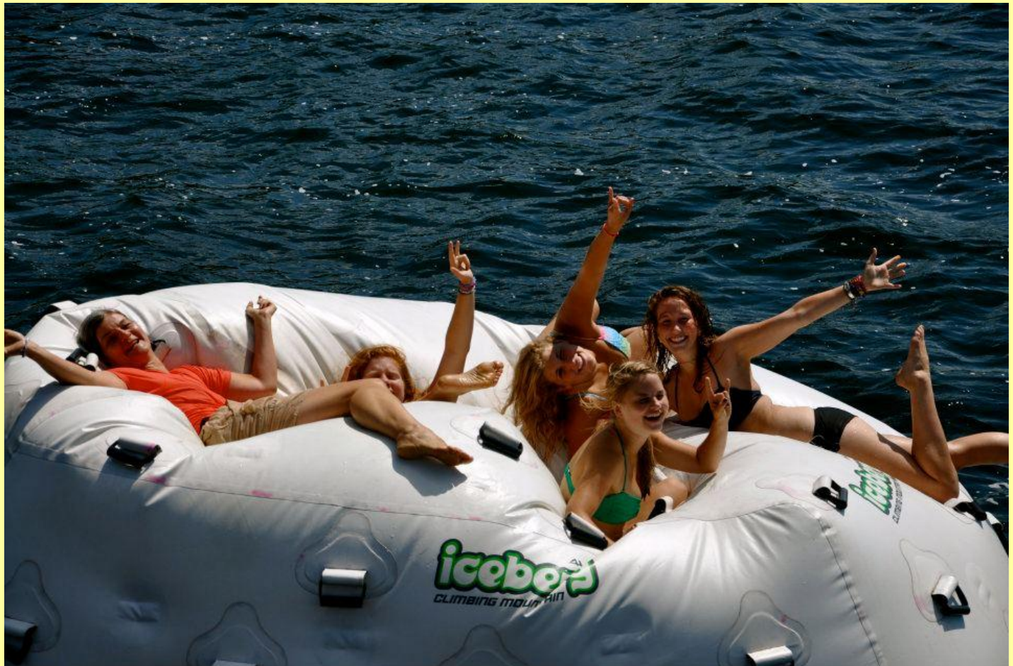
Four of the 2011 Section Heads and I deflating the Ice Berg on the last day of camp.

One of my favourite parts of being a Camp Director is allowing young woman a space in which to be completely comfortable and carefree, away from the stresses of boys, school, media image and more. At Oconto, we encourage wacky, out of the ordinary, creative behaviour every single day and hope that our girls can go home at the end of the summer bringing with them a sense of lightness that comes with being true to yourself. I am lucky to have a life and a job that allows me to have fun every single day, and I hope that you are fortunate enough to have the same.