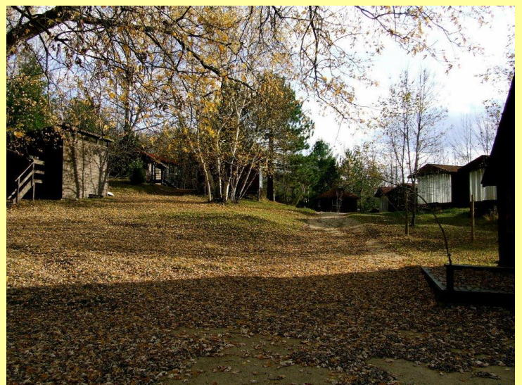
There will be plenty of raking for Work Camp 2012!