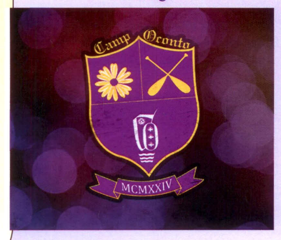
Our new Oconto Coat of Arms!