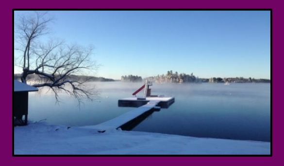
December 2013, Eagle Lake Freezes Up